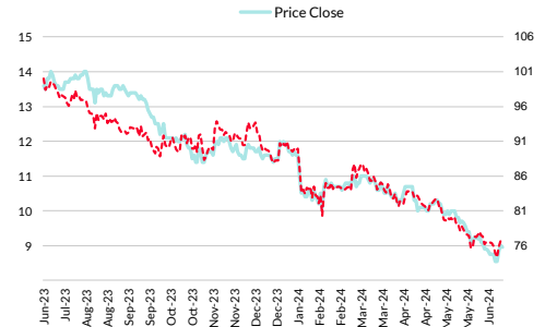
Home Product Center (HMPRO TB)